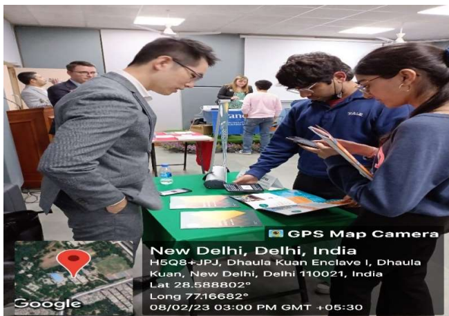
Picture: One on one interaction between the Guests and Participants

Then each of the visiting Representatives set up a separate desk in the Seminar Hall to interact one-on-one with the interested students and patiently cleared all their doubts and queries.