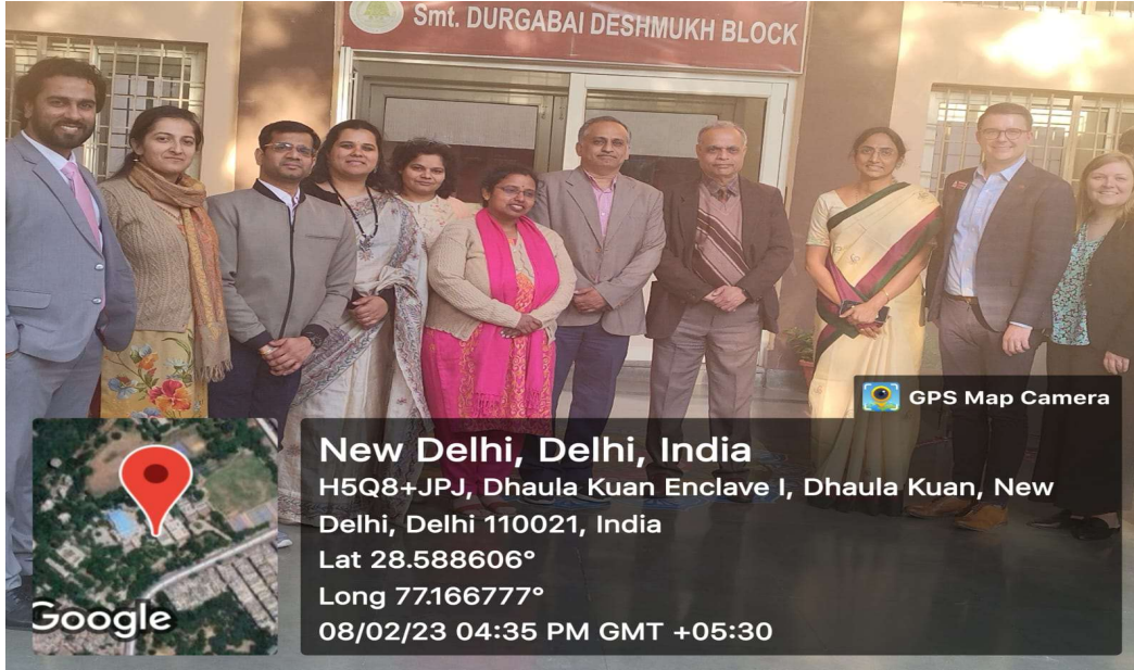
Picture: Guests With the Organising Committee

Sri Venkateswara College, University of Delhi, in collaboration with Seed Global Education conducted a Higher Education Conclave on Wednesday, 8th February, 2022 at 2:00 P.M. in the Seminar Hall, Durgabai Deshmukh Block. This event was attended by 138 students across all courses and years.