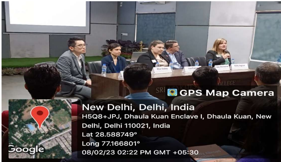
Picture: Panelists addressing the student queries