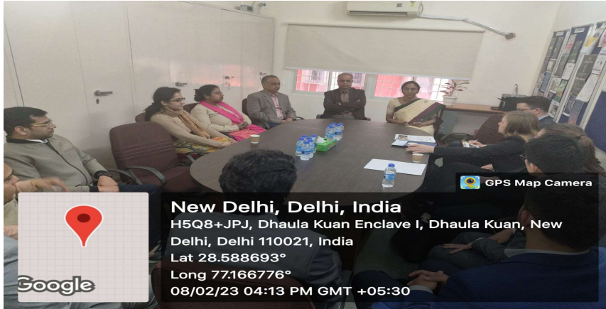
Picture: Interaction of the Guests with the Principal and Senior Faculty

The event ended with an interaction of the representatives of the Foreign Universities with the college principal and organising committee to discuss the possible collaborations between the institutions.