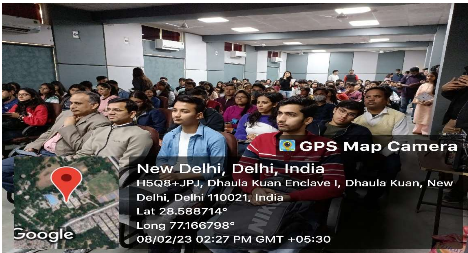
Picture: A glimpse of the participants during the Panel Discussion

Representatives from various top Business Schools graced the occasion and enlightened the audience with valuable insights into the admission process, courses offered and scholarships available for the students aspiring to study abroad.